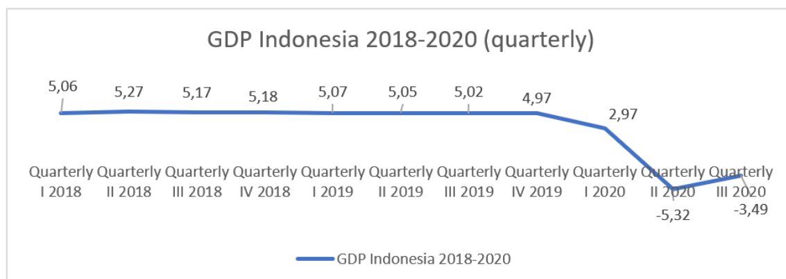
Figure 1. Gross Domestic Product Growth Rate 2018-2020